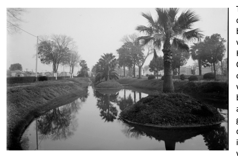
Remnant of Bayou Metairie, known as Horseshoe Lake at the time (c1910), with Metairie Cemetery on the right and Metairie Road on the left.

The only sections of Bayou Metairie not considered a nuisance were those that been landscaped, and both were located within Orleans Parish. One, known as Horseshoe Lake, paralleled Metairie Cemetery and featured weeping willows, ornamental bridges and islands. Pretty as it was, Horseshoe Lake also formed a traffic bottleneck, as narrow Metairie Road was among the few arteries connecting the two growing parishes. As part of Mayor deLesseps "Chep" Morrison's street improvement program, Metairie Road was widened in 1953-1954 from two to four lanes at the expense of the ancient waterway. Bayou Metairie was, quite literally, buried at Metairie Cemetery.