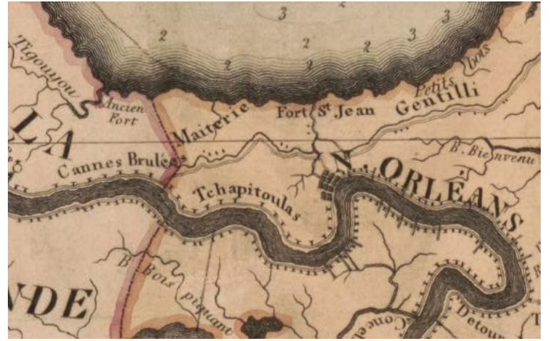
This 1806 map by Barthelemy Lafon, titled Carte generale du territoire d'Orleans, prominently depicts the Metairie-Gentilly bayou and ridge.

Over the next 1,200 years, the river would jump twice more and eventually settle into its current channel.