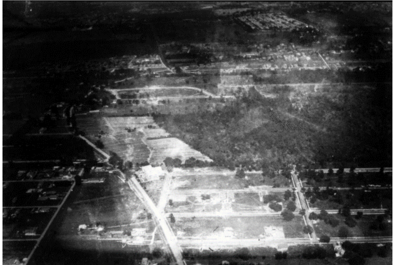
Rare aerial photo of Metairie Road in late 1920s, bayou may be seen paralleling road at left center.

Farm Sites With City Advantage," proclaimed a 1914 ad in the Times-Picayune . "The urban farms are only ten minutes from New Orleans." A similar operation, Metairie Nurseries, covered 200 acres with numerous greenhouses along the road, said to be the largest nursery in the South.